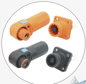
ESS-Industrial And Commercial Connectors